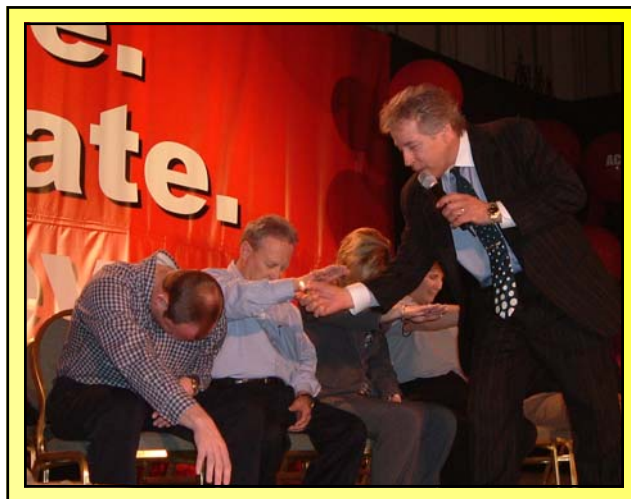
Sales, marketing and operations of American Home Shield fall into a deep trance at their annual meeting at Chicago's Palmer House Hilton.