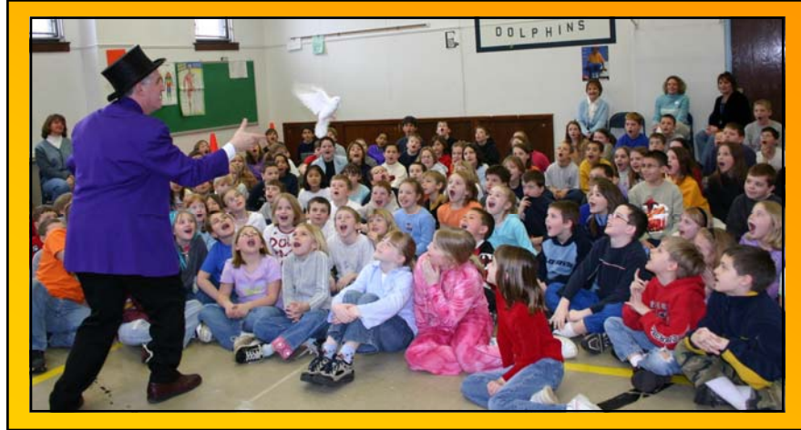
Snowball the dove magically appears and circles above the heads of the audience during a family event at a Chicago suburban school.