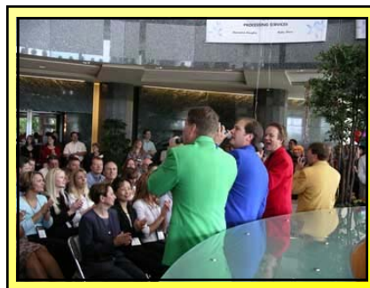
Ac Rock entertains the staff of Discover Card.

Include the musical talents and creativity of Ac·Rock at your next event. They'll put a smile on your face and a song in your heart.