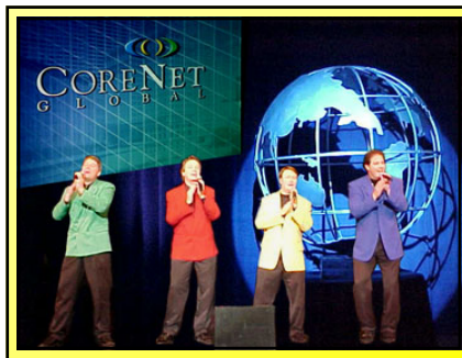
The National Sales Meeting for CoreNet.

Ac·Rock custom tailors each show for individual client needs. Whether they're the musical portion of an awards program or the themed singers for a program kick-off, Ac·Rock is the perfect choice. They