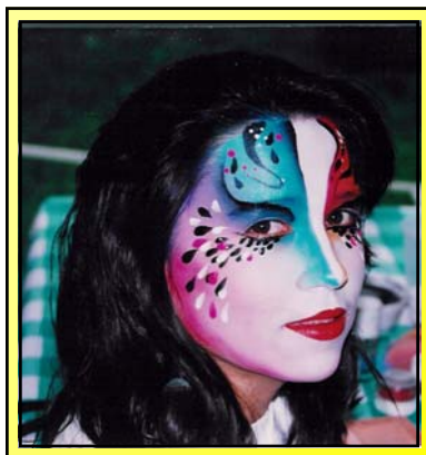
Tri-colored face art.