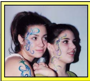
Blue swirls for sisters

The paints are safe and non-toxic. The artwork will last for a few days, but can be washed off with soap and water after the event if you wish. But before you apply the washcloth, take a digital picture and you'll have a memory to of your special occasion to keep forever.