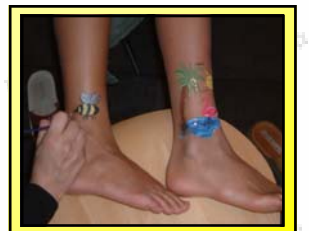
Body art is afoot at a Lettuce Entertain You event.