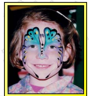
Girls love a butterfly face.