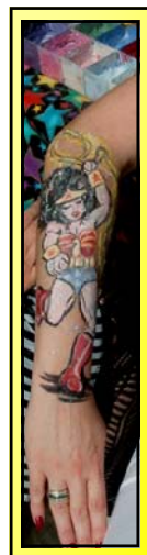
Armed with Wonder Woman