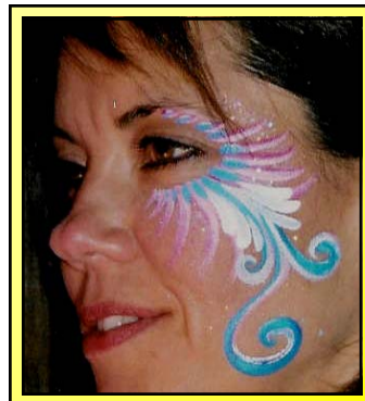
Temporary eyewear at a Mardi-Gras Festival.