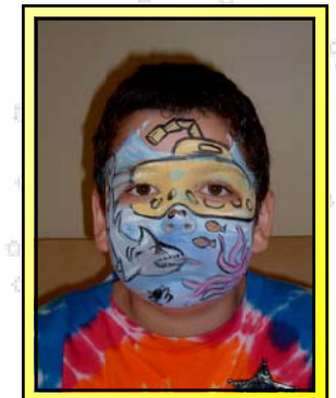
National City Bank receives a shark-face at a grand opening.