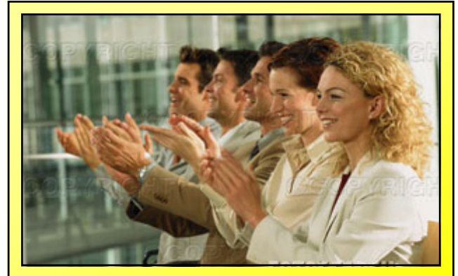
Your staff will stand up and shout out the name of your company or product when they play Corporate BINGO.

Everyone gets their own BINGO card and the numbers are drawn. The tension builds as everyone focuses on tracking their own BINGO card. Then, when our expert calls, perhaps the ninth or tenth number, suddenly, the entire audience is on their feet shouting out your company's name.