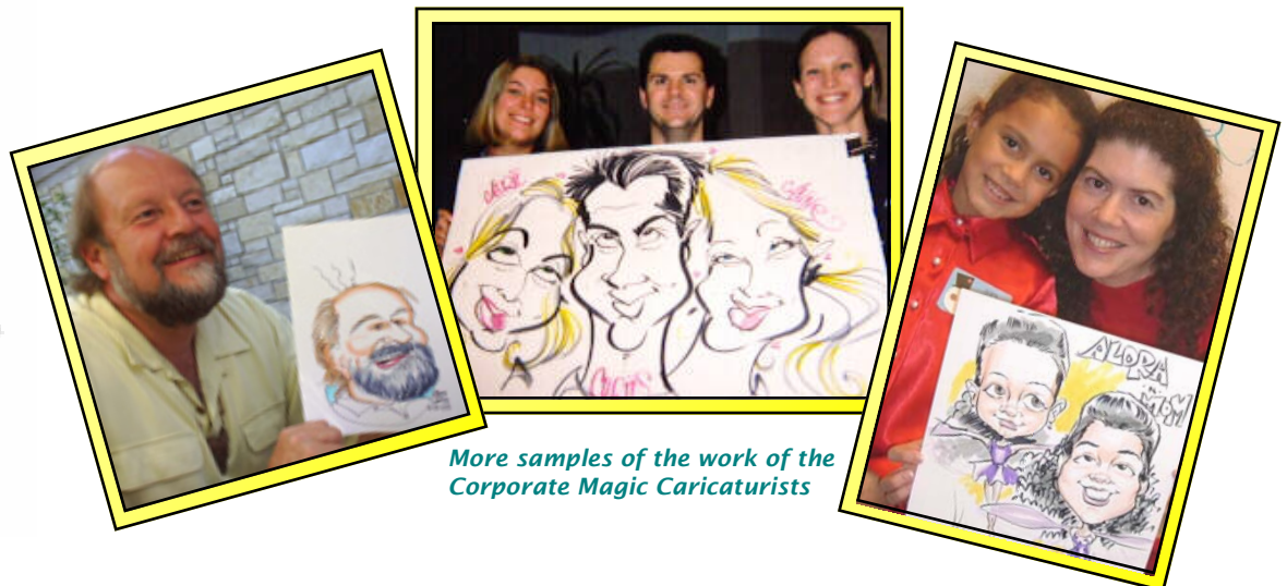
More samples of the work of the Corporate Magic Caricaturists