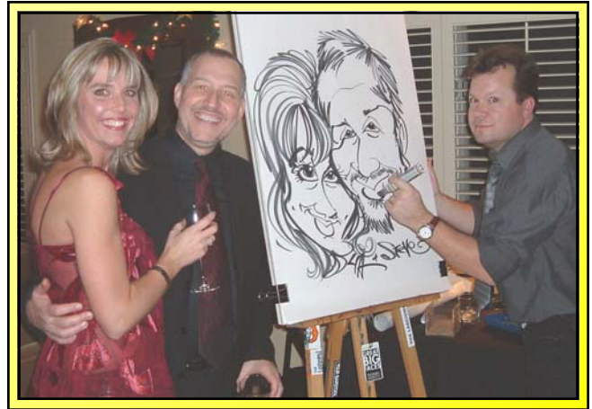
Paul draws Great Big Faces of guests at special events.

If a picture's worth a thousand words, then a giant caricature's worth ten-thousand! And these huge, 3-foot high images say it all! Paul specializes in drawing great big faces at rapid speeds. The process is as amazing as the end result which, of course, each guest rolls up at the end of the party so they can bring it home.