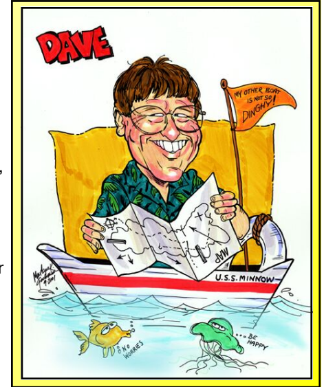
Something's fishy with this personalized caricature by Marlene.